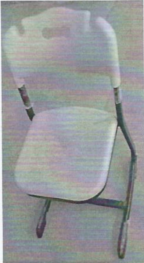
Photograph of Chair and Table